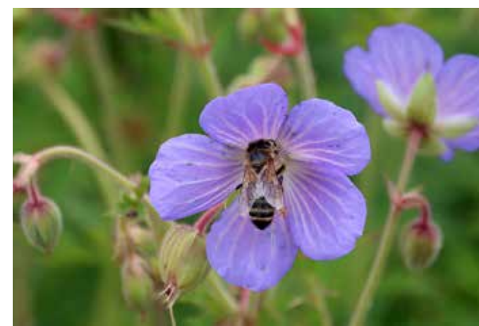
Wheldrake wildflower verge heading north from Wheldrake towards Crockey Hill 2023